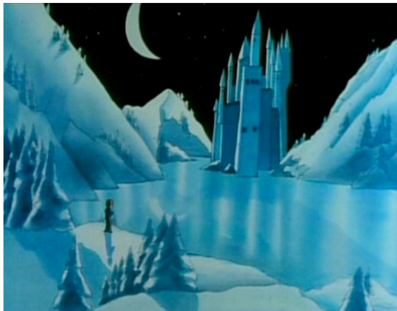
A scene from Bill Mendez' animated television version.